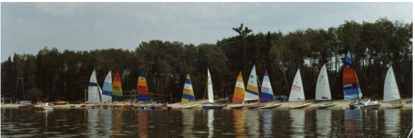
Saturday sailing races were a common sight in years gone by