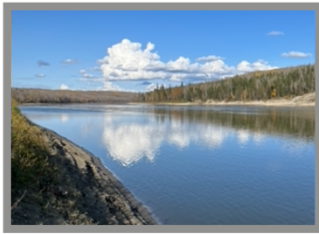
Beautiful Calling Lake Sunset. Photo taken in Sept 2023 by Beverly Mitchell