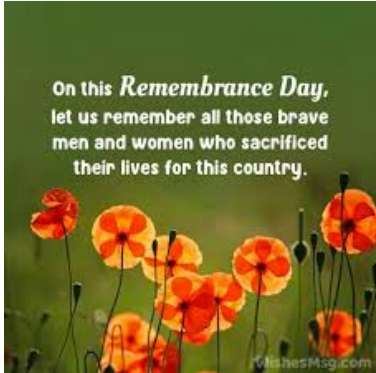
On this Remembrance Day , let us remember all those brave men and women who sacrificed their lives for this country.